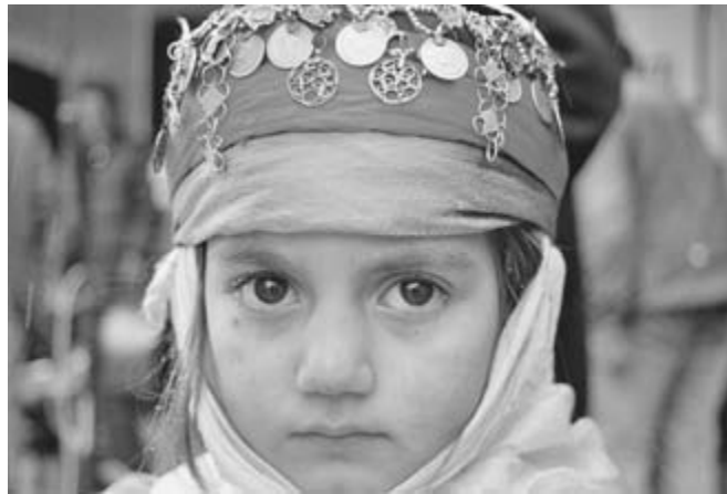
Left: A Kurdish girl dressed up to celebrate the Kurdish new year, March 2005.