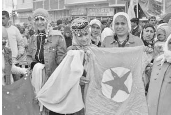
Right: Kurds, including a woman holding the PKK flag, crowd the center of Dogubayazit, in southeastern Turkey, to celebrate the Kurdish new year, March 2005.