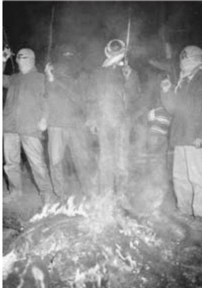
Above: These armed young men were part of the PKK's extensive network of active civilian supporters in the southeast, commonly known as milis . They often showed their strength during protests and funerals. This photo was taken in the southeastern city of Cizre in 1992, then a stronghold of the PKK.